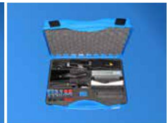
Rapplon® QuickSplice tool fitting set