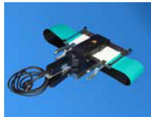
Rapplon® QuickSplice tool QSP 105

Please read the splicing instructions carefully.