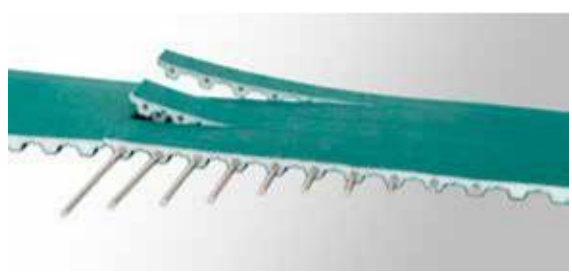
Just put the fingers together and insert the pins